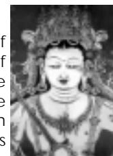
From Tabo: The Bodhisattva Suramgama ca. 1040 A.D.

I felt this to be an inspiring example of taking healthy aspects of Western culture and development to enhance and ease some of the difficulties of climate, isolation and economy, in the remote Spiti Valley. The visiting monk/architect spoke of how they have skilfully ducted heat from modern adaptations such as an atrium on the side of the monastery through bamboo pipes to hot houses in order to diversify the vegetable production for the health of the community. The international community benefit from the preservation of ancient artefacts and fresco paintings (see picture).