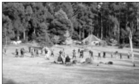
Qi Gong on the lawns.